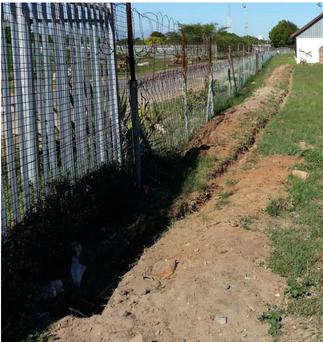
Trench for the security beams

The last few running days have been well attended by the public and an article in the Tygertalk newspaper gave the club some great exposure. Work has been done on the steaming bay retention wall to prevent it from pushing inwards as the traverser was catching on wall limiting use of the bays. Stolen piping from last year was replaced and cemented in. Alarm activations have dropped completely and the outdoor eyes have been installed covering the fence between the Scout Hall and our club house. There is still an outstanding wireless eye to cover the coal store.