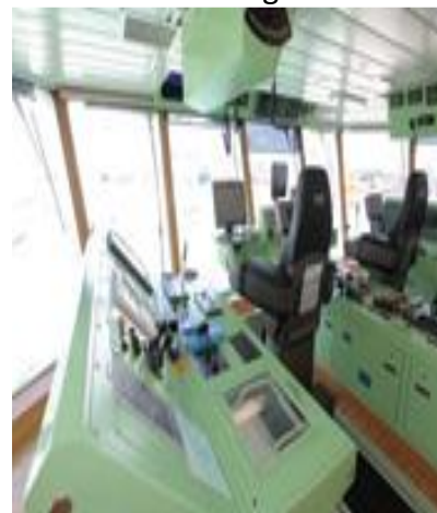
Aft conning position.

Because the vessel is designed for prolonged work in one specific position, most of the services are geared for self-sufficiency for up to 90 days, with Fuel Oil (Diesel) 1,440 m 3 , (estimated average use 11 tons a day)