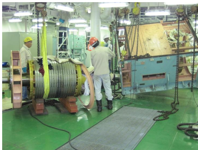
Main generator being removed during a previous repair.

Ian was especially interested in checking the specifications and manufacturing quality of the Korean manufactured generator units.