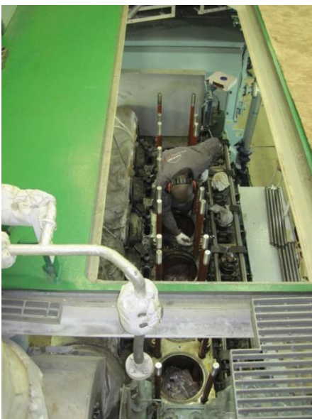
Main engine crankcase from above

Two Main Propulsion generators were being given their 12 000 hour overhaul, and we were able to see the real size of the cylinders and magnitude of the components.