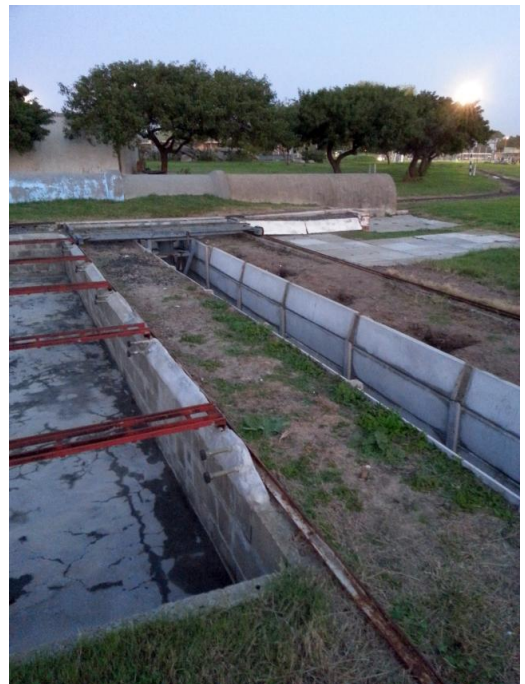
Steaming bay & traverser