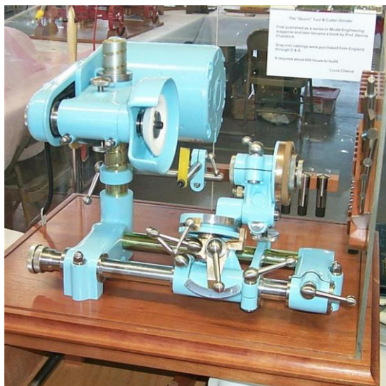
[Editor] I was not sure what a Quorn Tool and Cutter Grinder looked like and found this lovely example online.