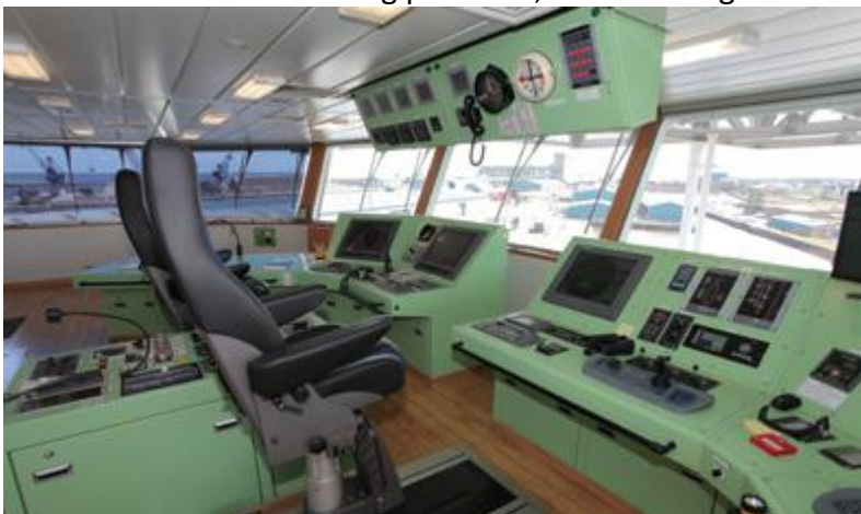
Forward conning position

We then completed the tour by finishing on the bridge...after climbing 7 deck levels! This bridge design offers astern and forward conning positions, with 360 degree vision all around the bridge.